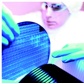
FOR CLEAN ROOMS, E.G. IN SEMICONDUCTOR MANUFACTURING