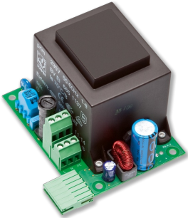
EXPANSION MODULE EM- TRF