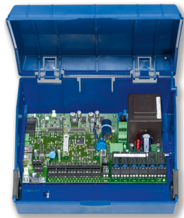
EASYPAC ADAPTER MODULE TAM