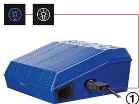
BUTTONS ON THE CONTROL PANEL TO SWITCH THE LIGHTING ON/OFF