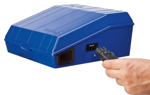
CONNECTION SOCKET FOR LIGHTING